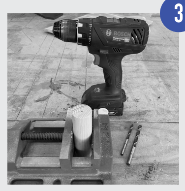
Drill a 40mm deep hole on both ends using a 6mm drill bit