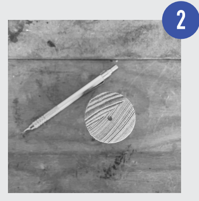
Mark the center