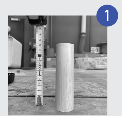
Measure and cut out piece