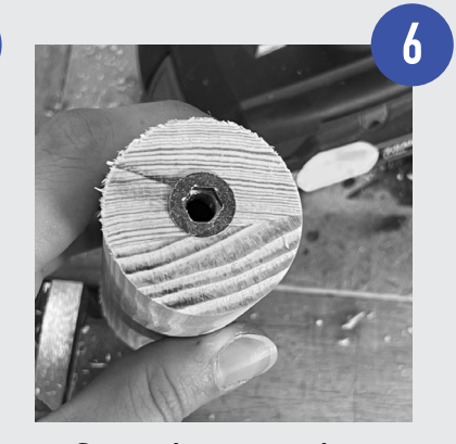
Screw insert nut into piece on both ends

*For 30 mm rod, grab only one insert nut