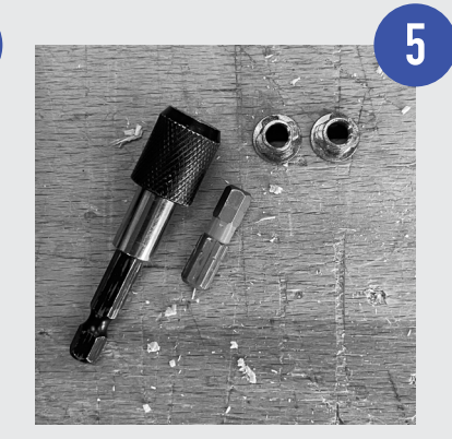
Grab drill bit extender, the proper sized bit, and two insert nuts

*For 30 mm rod, grab only one insert nut